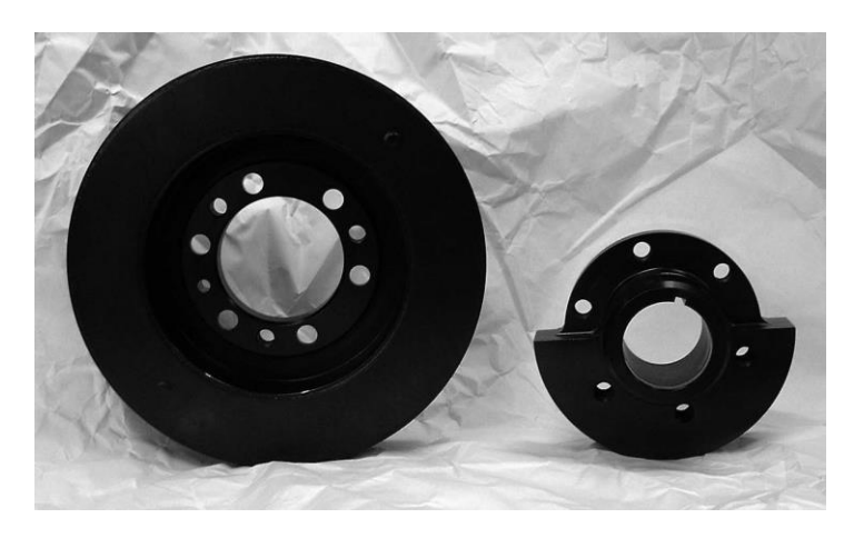
Damper Ring (A)

BALANCING OR MATCH BALANCING _-Fluidamprs designed for externally balanced engines include the damper ring (A) bolted to a counterweighted hub (B). See photo below.